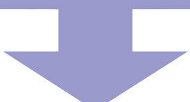
7. Irripod System