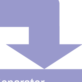
4. Solid Separator