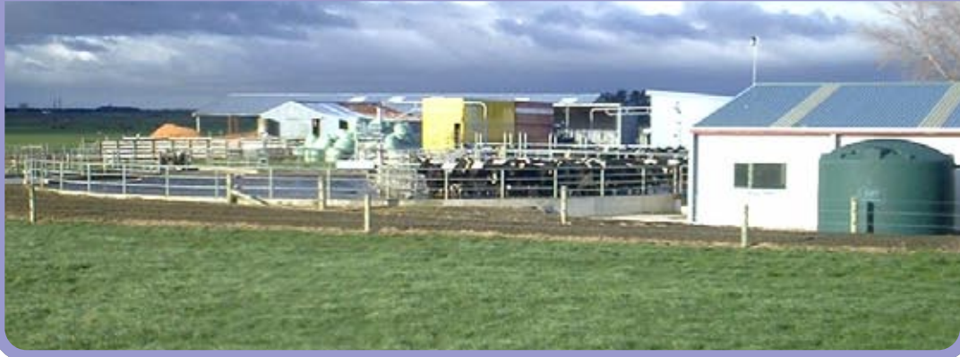
1. Dairy Shed